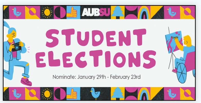
It's the big event that everyone at AUBSU is talking about. Its time to start scouting for some brand new Executive Officers in our 2020 Students Elections!

A full list of events and how you can get involved, can be found on the <u>AUBSU website</u>. Don't forget, you can also follow your officers on their dedicated Instagrams! <u>@aubsu_lgbt</u>