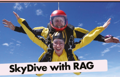
SkyDive with RAG